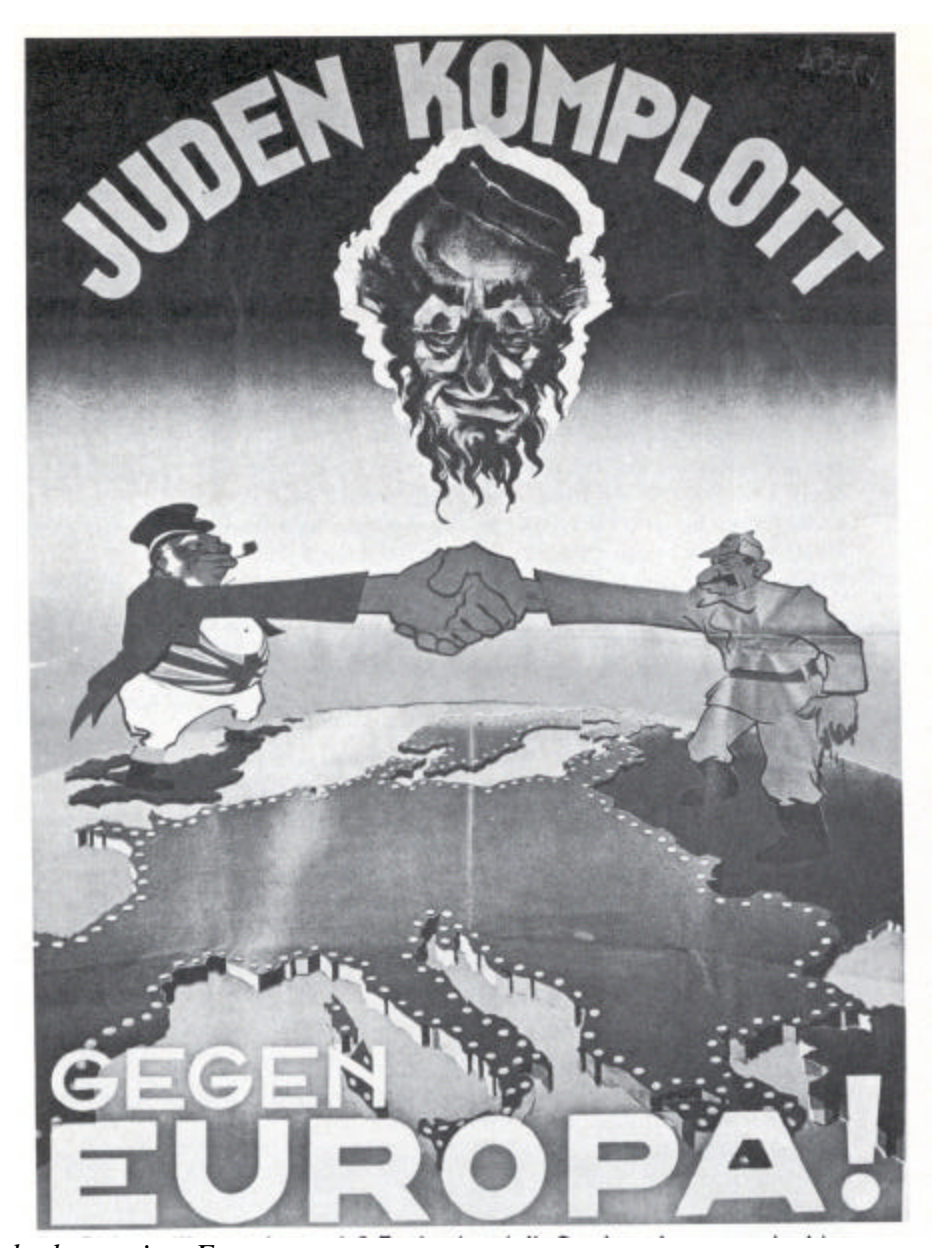
The Jewish plot against Europe

Who are these characters? What does the poster suggest is happening? Can you tell about when the poster was produced?