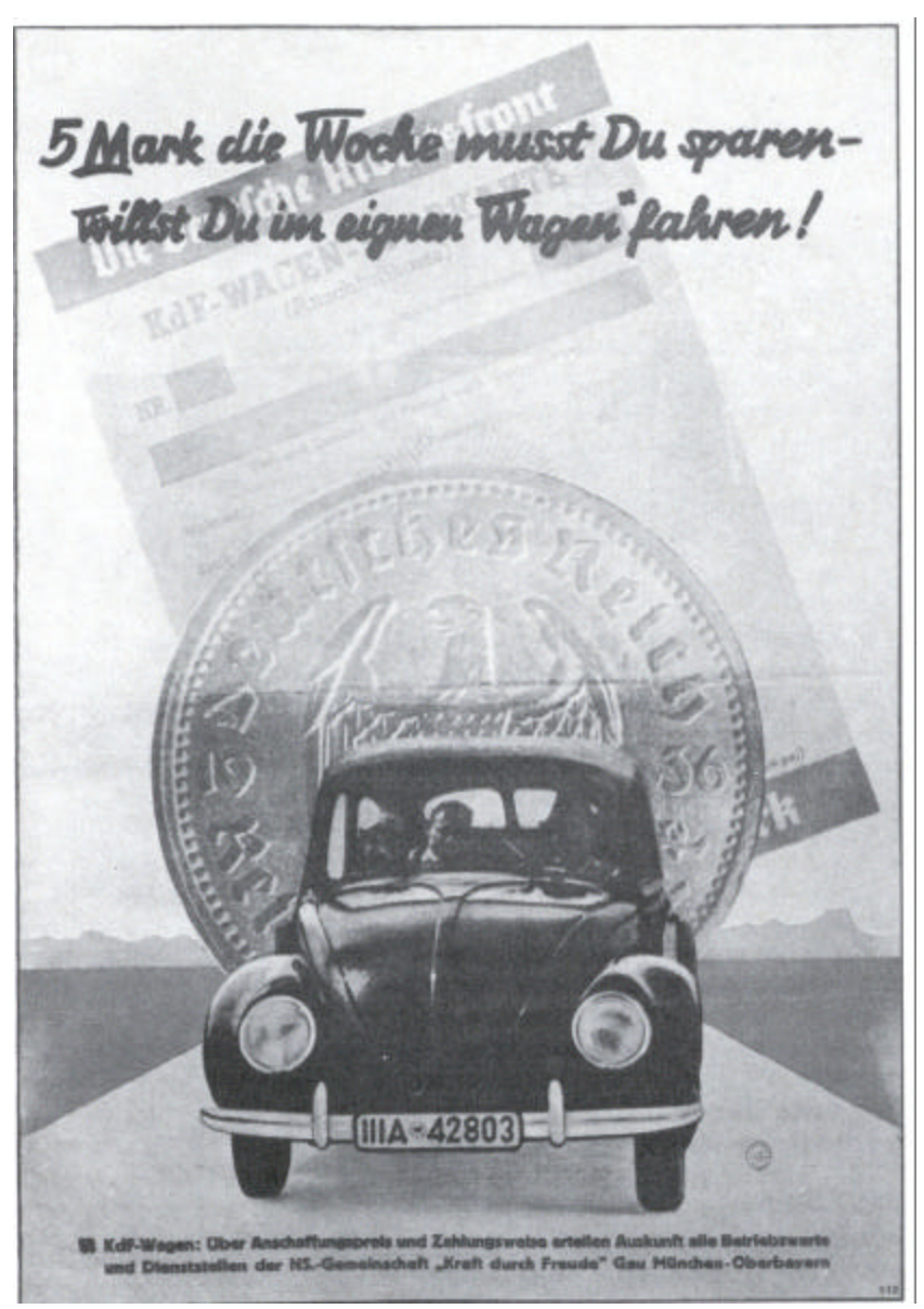
"If you save 5 Marks a week you can own your own car!"

This enticing offer was made to the German people in 1938 when the famous Volkswagen was first introduced. Over 300,000 Germans signed up and paid weekly into a savings account that they thought would get them a VW after 3 years. But the Volkswagen factory had, already since 1936, been a part of the "4-year (rearmament) Plan" and was building only military vehicles; no cars were ever delivered. What conclusions can you draw from this?