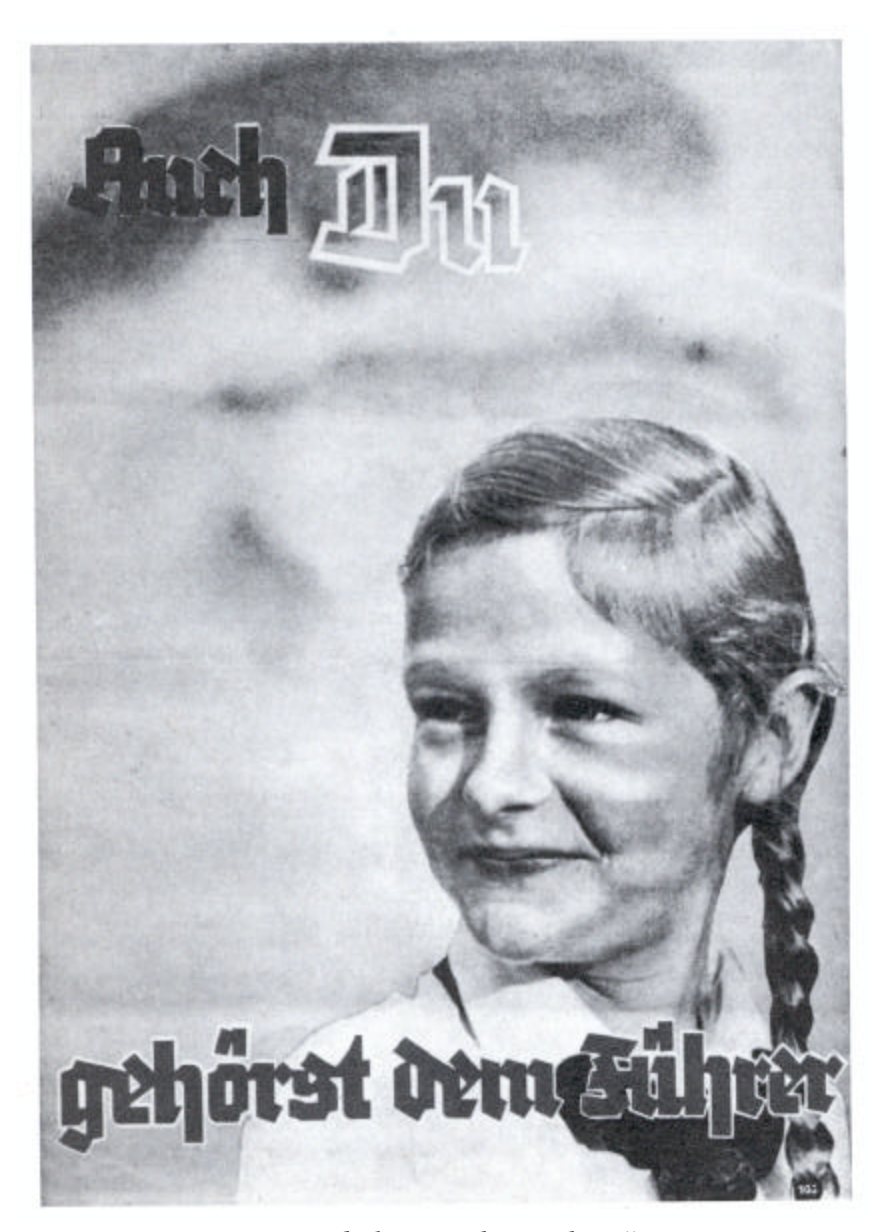
"You too belong to the Fuehrer"